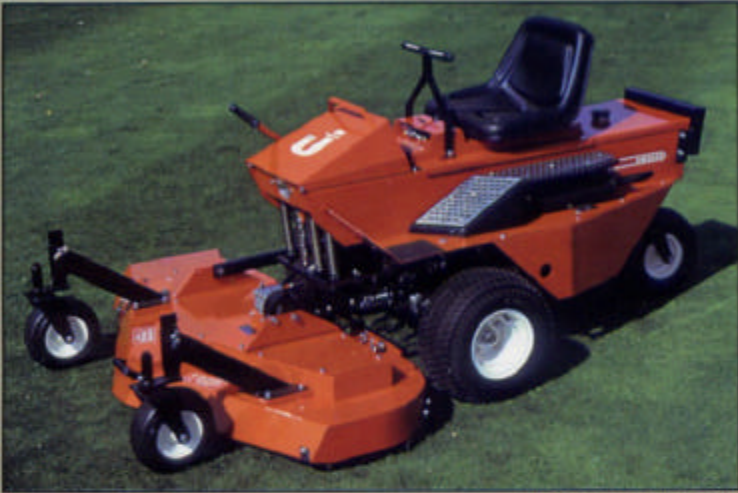
MODEL HT 1860