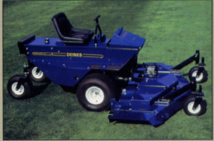
MODEL HT 2072